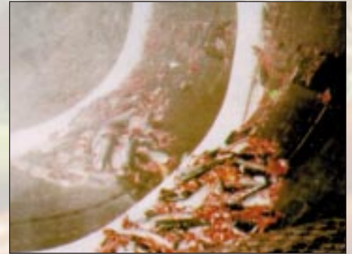
Fish processing operation — total plant effluent.