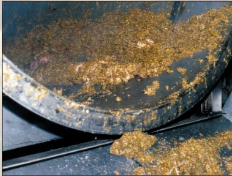
Slaughterhouse application — total plant effluent.