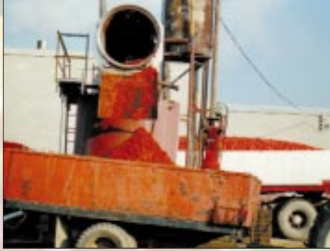
Produce operation doing tomatoes, potatoes, mushrooms, etc. Lye peeled tomato operation shown. Operation is accomplished without backwash. There is very little free water with the solids — note the peak of the solids.