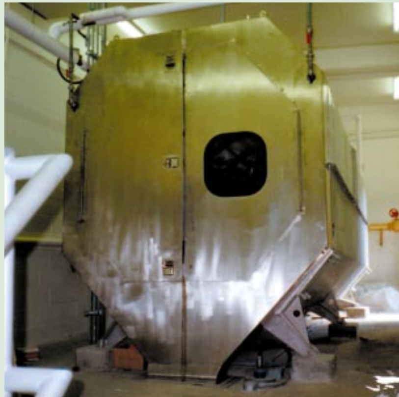
Typical MDS Installation

Wheels As simple as wheels are, BAYCOR has made a science out of them. Our wheels have been totally designed for maximum life and minimum maintenance. Two heavy duty dual-row 100,000 hour bearings serve each wheel. Wheels and bearings operate at a small fraction of their maximum load. A unique feature of our advanced design also eliminates the need for separate guide rollers or cam followers. BAYCOR's wheel design is engineered simplicity.