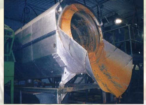
Produce operation doing peas, beans, corn, carrots, root crops, etc. Carrot operation shown.